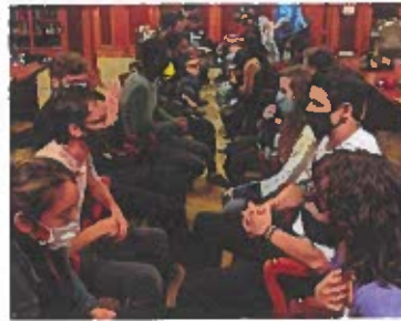
Students get to know each other during an ice-breaker game at the Newman Hangout after 5pm mass.