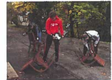
Students volunteered a Saturday morning to help the Sisters of Mercy clean up for winter at the Mercy Spirituality Center.