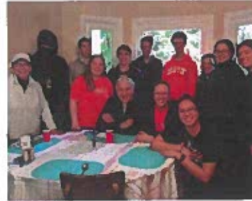
After helping clean up at the Mercy Spirituality Center, students enjoyed some down time (and snacks of course!)