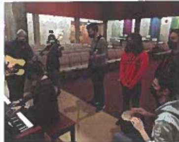
The choir practices for a Sunday mass in the Allen Chapel.