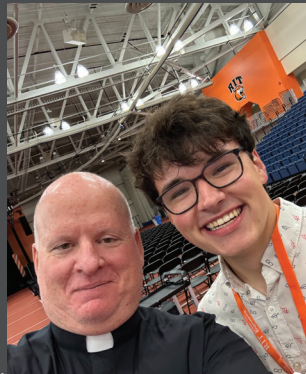
Orientation Selfie with Father Cool!