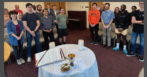
Eve Away Retreat