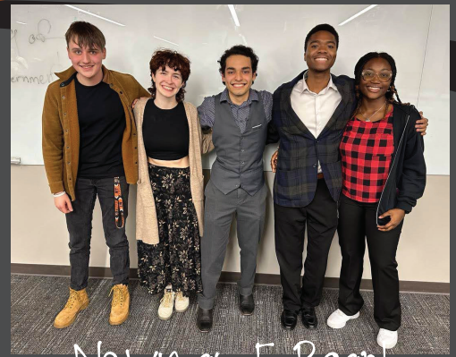
Newman E-Board 2024-2025