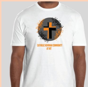
2025 Newman T shirt