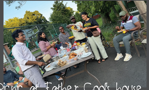
Picnic at Father Cool's house