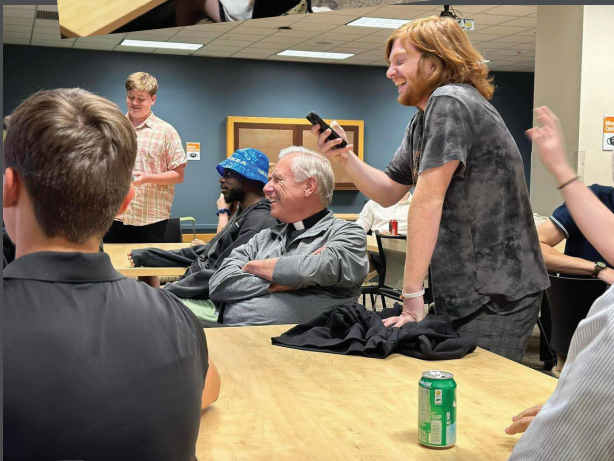
Family Feud during a Newman Hangout