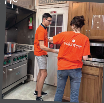
Tiger Stripes Service Day