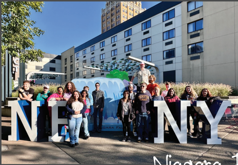
Niagara Falls Trip