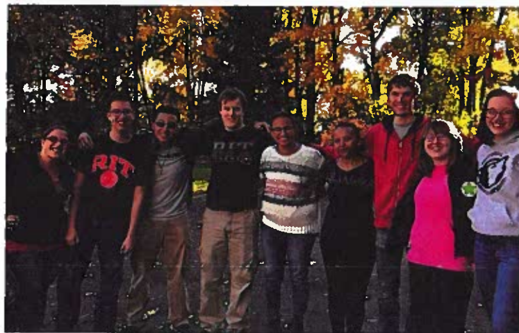
Service Day at the Mercy Spirituality Center