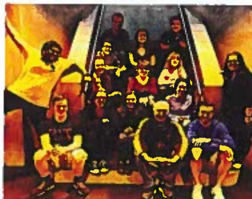
Eve Away Retreat, Camp Stella Maris Team-Building, 2019