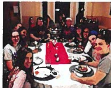
Enjoying a meal at the Kairos Retreat in February 2019.