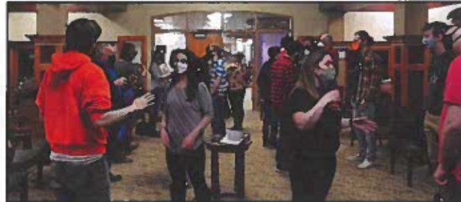
Students had the opportunity to meet other Catholics on campus.