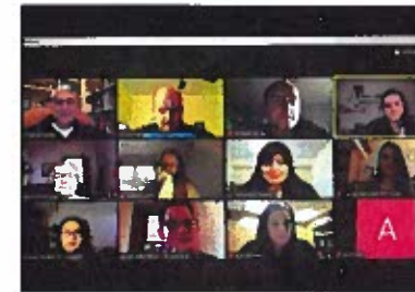
Multi-Campus RCIA Program

I have learned a lot about the Catholic faith during the RCIA process. As I mentioned, I did not have a strong religious foundation, so I learned a lot from the RCIA classes. Perhaps the most important thing I learned in RCIA is how to pray properly. I prayed in the past, but I felt as if I was doing it wrong, and I did not know what I was doing. The opening and closing prayers and discussions about prayer taught me how to pray, which made my prayer life more meaningful. I also got a better idea of how I should live my life and listen to God. Learning about the Beatitudes really helped me get a better idea of how I should live my life. When I am angry, I remember that Jesus wants us to control our anger, which helps me let things be. Everything I learned in RCIA strengthened my faith and brought me closer to God.