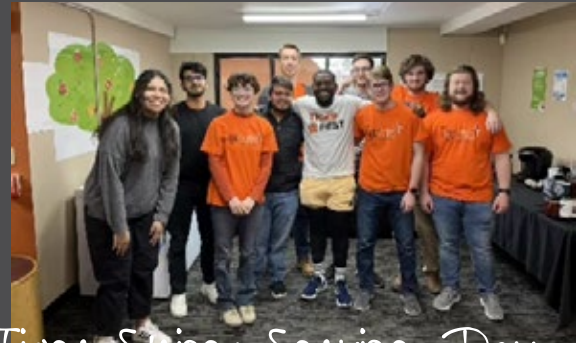
Tiger Stripes Service Day