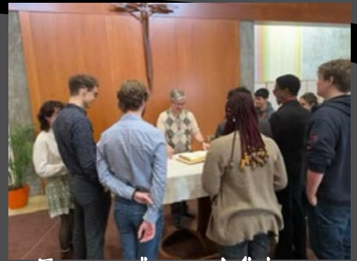
Extraordinary Minister Training