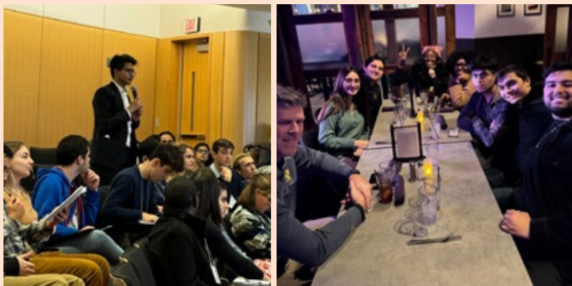
Collis Institute Cornell University

This November, ten students from the RIT Catholic Newman Community attended the COLLIS Conference at Cornell University , an event designed to foster the integration of faith and reason, empowering young Catholic scholars to think deeply and transform both the world and their campus communities. Founded in 2022 by Cornell faculty, the COLLIS Institute for Catholic Thought and Culture aims to enrich intellectual and spiritual formation by exploring how academic disciplines can glorify God and contribute to human flourishing.