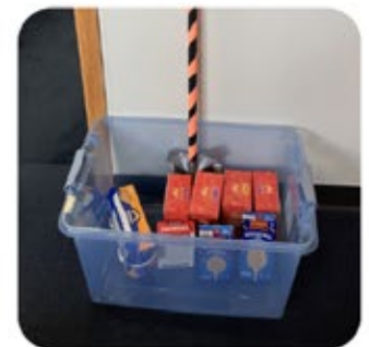
Our collection bin for FoodShare donations is placed outside the chapel every Sunday.

food pantries. By strengthening connections between FoodShare and our Catholic Newman Community, we aim to broaden awareness and ensure all students know they can rely on this essential source.