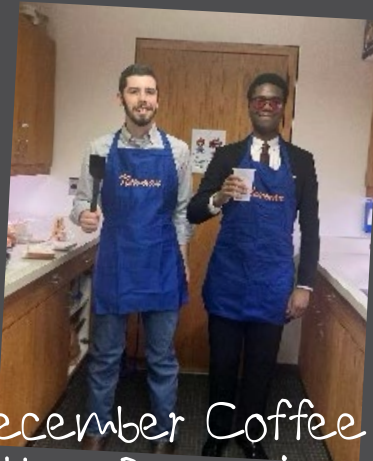
December Coffee Hour Preparation