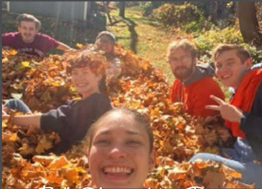
Fall Clean Up Day Service